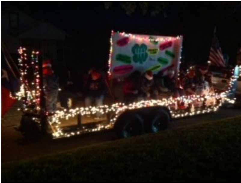
Mexia Parade of Lights Float