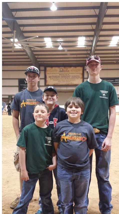
Young County Archery Shoot

See more photos for this club on the next two pages.