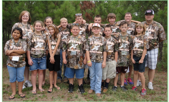
2013 County Camp