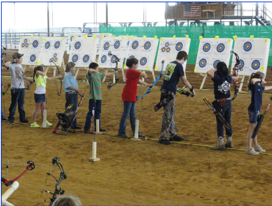
1st Limestone County Archery Tournament was held in October 2013