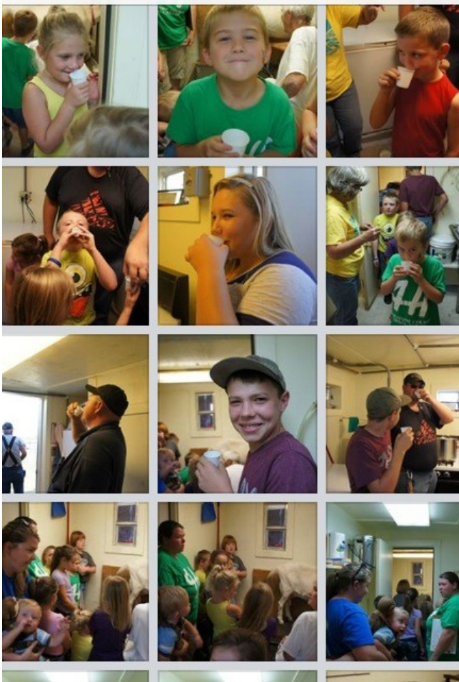
2-L Goat Dairy