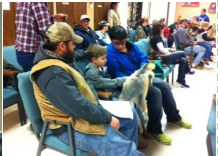
Ten Point Taxidermy

On Wednesday, May 21st , we'll hold a Youth Ag & NR Expo for 2nd and 3rd grade students at McBay Elementary in Mexia. We will be teaching about 300 kiddos!