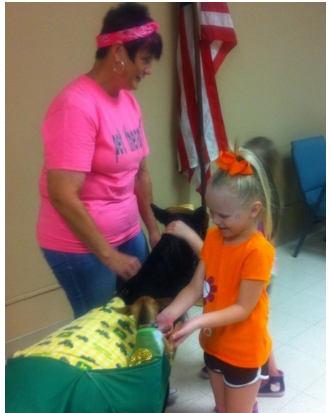
Equine Pet Therapy