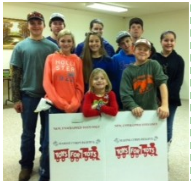
Toys for Tots