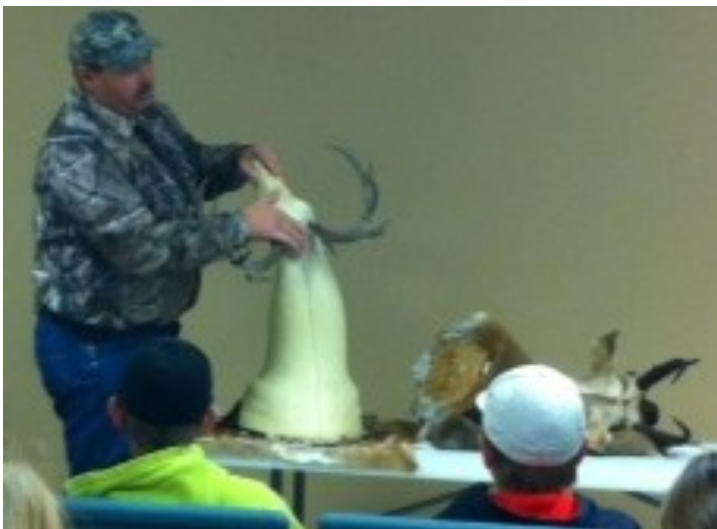
Ten Point Taxidermy