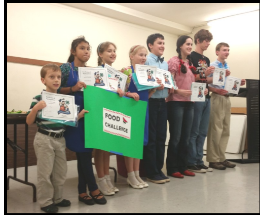
2015 Food Challenge and Food Show Participants

Check with your county for county practices, contests and qualification